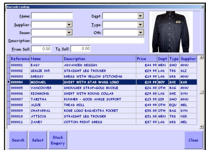
Instant search for any item