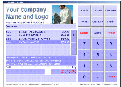
Touch screen till - customer defined keys